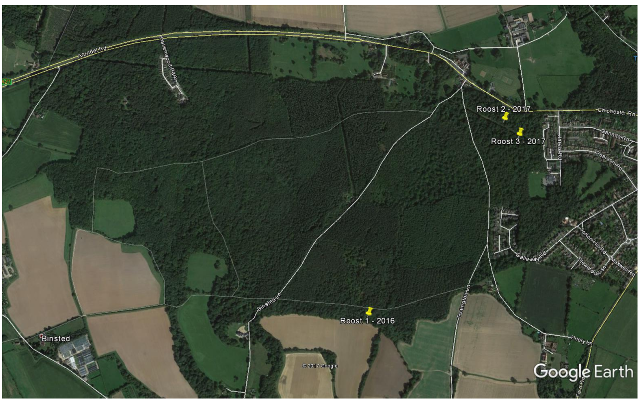
Figure 2 – showing locations of identified Bechstein's roosts in 2016 and 2017

5.7 Alcathoe bat – this was tagged on the 24<sup>th</sup> May – this species was known to be present locally and breeding females were caught in 2016 and roosts identified through tagging one individual. See figure 3