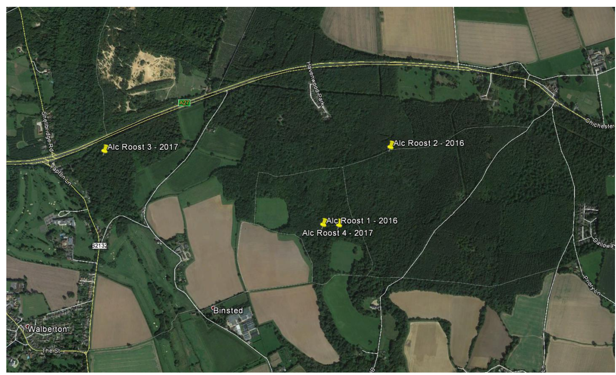
Figure 3 – showing locations of identified Alcathoe roosts in 2016 and 2017